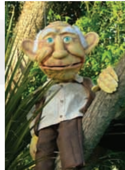
Fibín: An explosion of joy and happiness

Fibín is a theatre company founded in the Gaeltacht, operational throughout Ireland and the world, dedicated to the provision of high quality drama for children in Irish. It aims to provide employment in the field of the arts within the Gaeltacht through the development of skills in acting, puppeteering, set design, writing etc. It aspires to reawaken an interest in Irish language drama and tap into the rich folklore, culture and tradition of Ireland through the use of innovative and exciting methods of production, direction and action. Fibín offers a combination of drama on the big stage, which tours the country and children's festivals, smaller productions that can be brought around to schools and on a more intimate level and workshops which are available in the classroom.